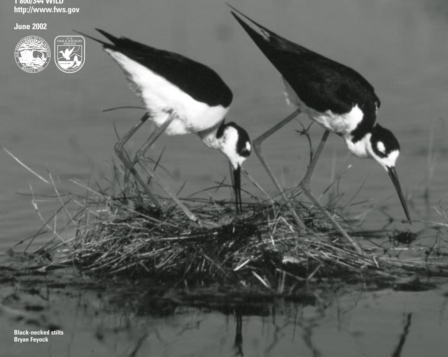
Black-necked stilts Bryan Feyock