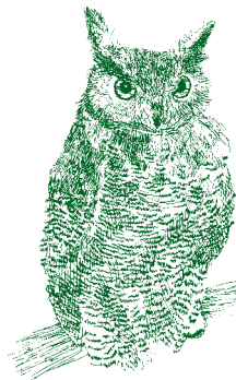
Great horned owl