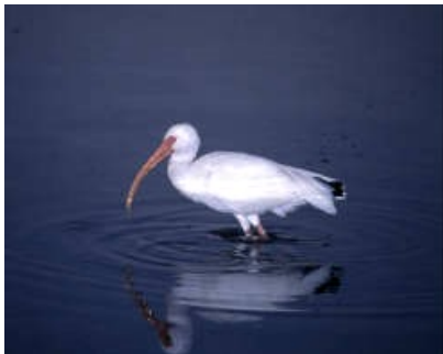
White Ibis

A White Ibis was seen during late October. Peregrine Falcons were present during much of the period, in particular October and November when they harassed arriving waterfowl and shorebirds in the impoundment and over the salt-marsh.