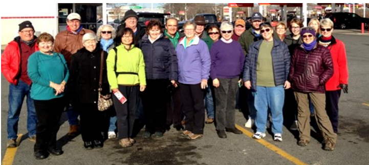
The New Year's Day Group Before Heading Out

You are encouraged to attend the Bird Club's field trips. There are no dues, fees or meetings; the Club just goes birding! You can attend as often or as seldom as you want. The only requirement is that you be on the Club's email list. Dates, times, meeting places, special instructions and any last minute changes are communicated via this email list. You do not have to be a member of the Friends, either, although it is hoped that you eventually will want to do that.